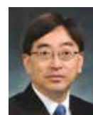
Dr Ko Wing-man, BBS, JP Secretary for Food and Health